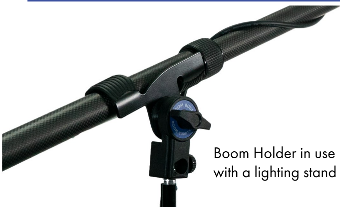
Boom Holder in use with a lighting stand