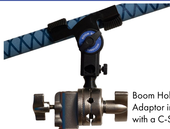
Boom Holder with Adaptor in use with a C-Stand